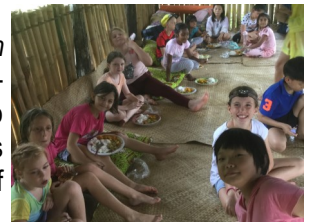
Students at the Namosi Camp

Our term overview will be available during our Year 4 information session at the Parent's Information Evening . This overview indicates the learning that will be taking place within the different subject disciplines during the two units of inquiry we will be investigating over the course of this term. Please also find attached our timetable for the first six weeks of this term. As our subject discipline focus changes with each new inquiry an updated timetable will be emailed to parents at the beginning of each unit of inquiry. We will be discussing this overview and our timetable at the Parent's Information Evening and will be happy to answer any questions you may have.